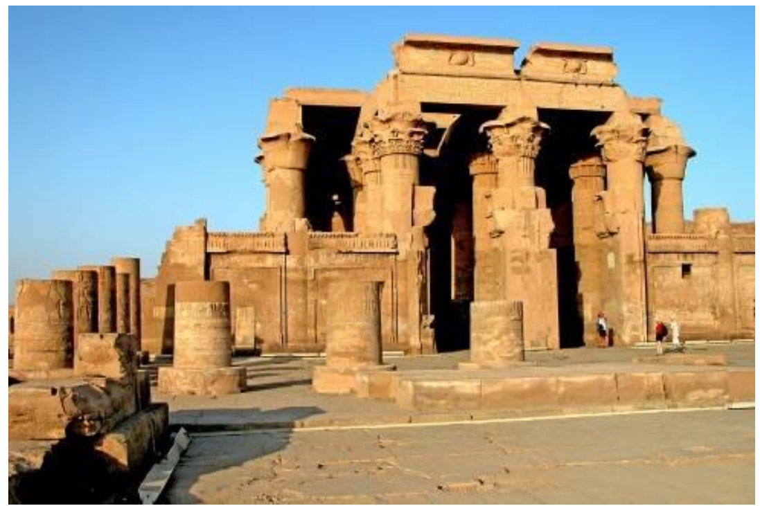
Double Temple of Kom Ombo