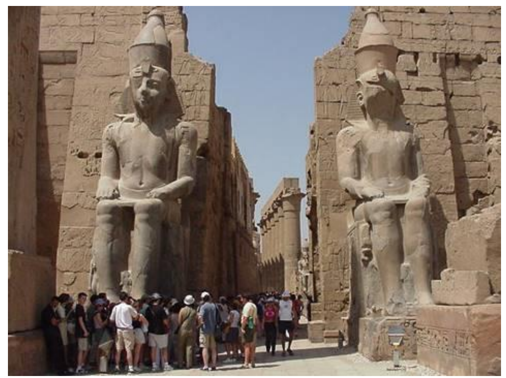
Luxor (rejuvenation) Temple