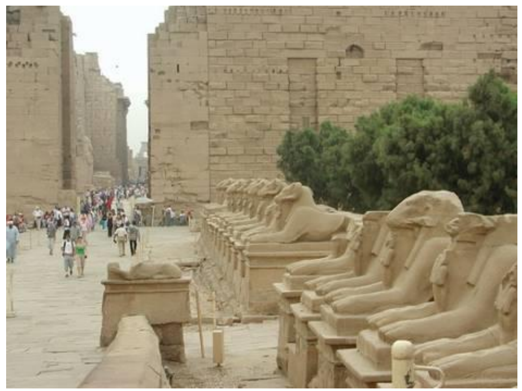
Temple of Amon-Ra in Karnak