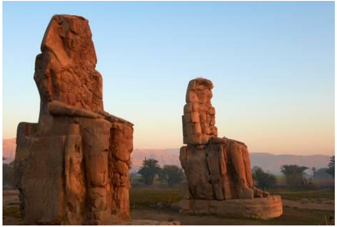
Colossi of Memnon