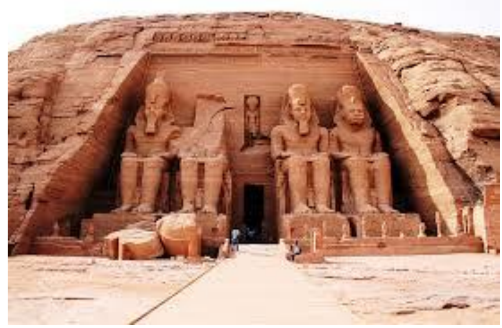
Abu Simbel temple

Breakfast in hotel, transfer to Aswan airport for departure to Abu Simbel, visit to Abu Simbel Temples (Great Temple of Ramesses II and Temple of Nefertari) , transfer to Abu Simbel airport for departure to Aswan. Meet and assist at the airport and transfer to 5-star hotel "Helnan Aswan", overnight in Aswan.