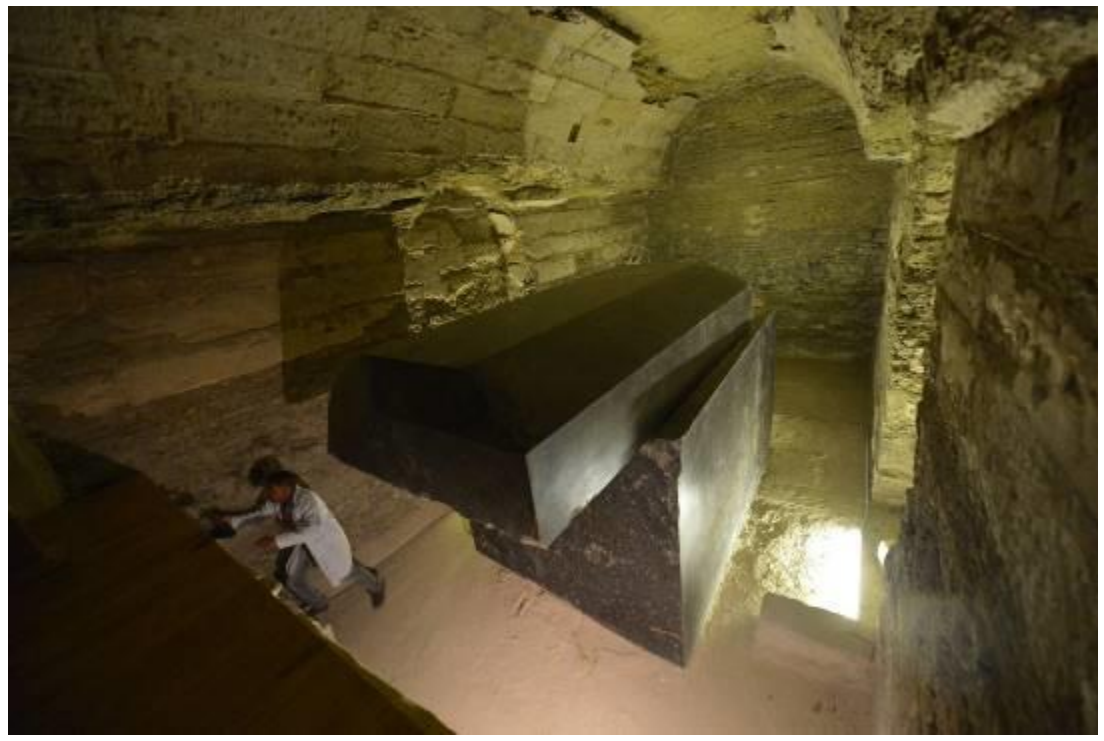
Mysterious Serapeum of Sakkara