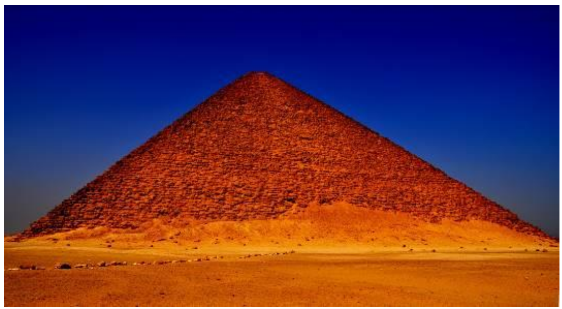
Red pyramid in Dahshur