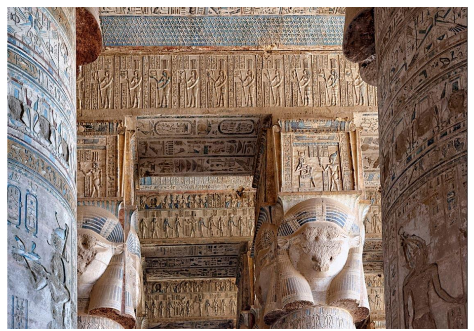
Temple of Hathor, Goddess of Love