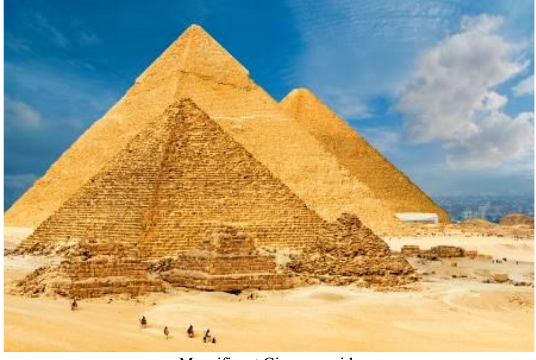
Magnificent Giza pyramids